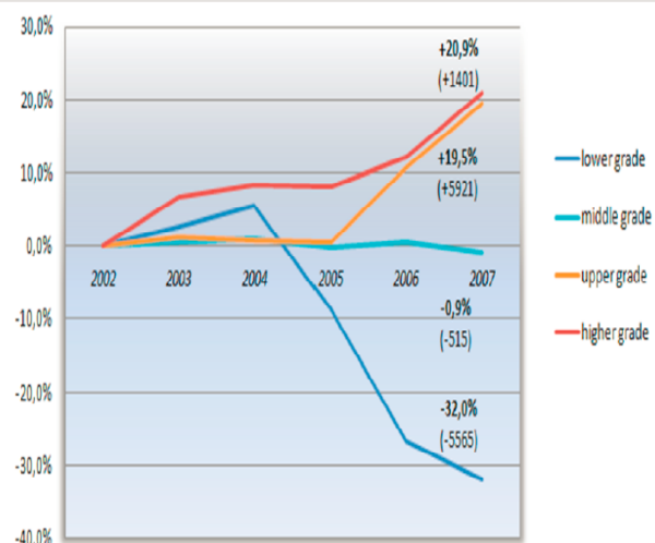
Figure 3 – Changes in the number of non-academic staff adhering to different status groups between 2002 and 2007 (in% and absolute changes)

1 non-academic staff at all types of higher education institutions in Germany